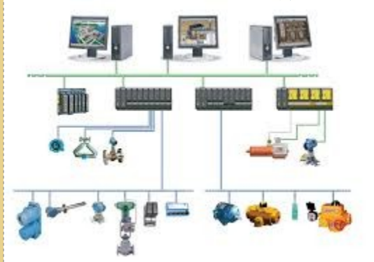
PLANT CONTROL SYSTEM